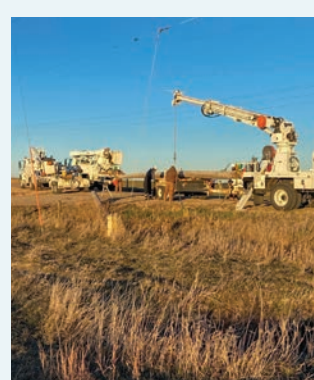
Left: The DSO Electric Cooperative crew works to restore power. Right: The Ark Valley Electric Cooperative crew assists in restoration efforts.